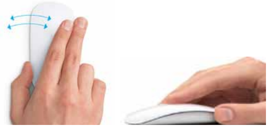
The wireless, button-less, multi-touch Magic Mouse.

On October 20 Apple released newly redesigned iMacs, an update to the base model Macbook, speed-bumped Mac minis and an all-new Magic Mouse.