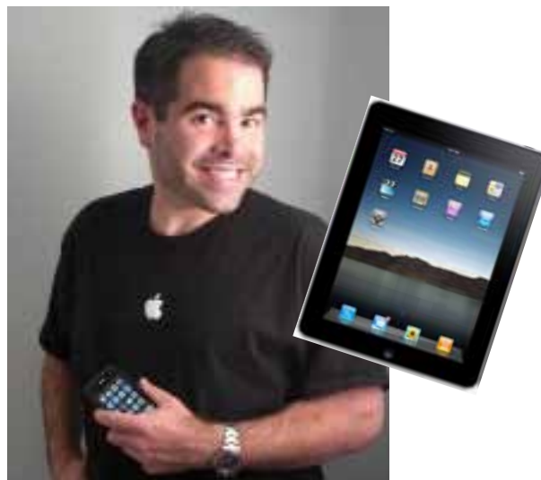
Learn all about the iPad on May 5!

Visit MUG ONE's web site at http://www.mugone.com