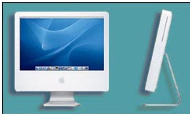
New G5 iMacs announced at Apple Expo Paris August 31

Visit MUG ONE's web site at http://www.mugone.com