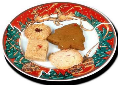
Please bring a treat to share for our December 5 meeting

Visit MUG ONE's web site at http://www.mugone.com